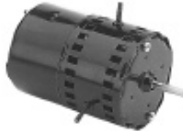
357 (Mid Continent)