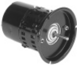
777 Delta Therm/DuoTherm #3-4084