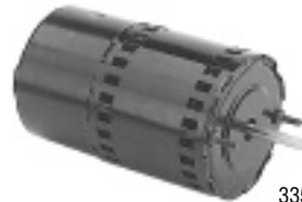
335, 553 (Miller)