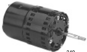
349 (Coleman) 2.63 B.C.