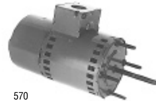
570 571 (Carrier) 660 653 (Rheem) 9409 (York)