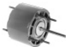
14, 15, 18, 19, 26, 27, 28, 29, 30, 31, 32, 33, 36, 308, 462, 534, 535, 539 948, 949, 980, 985

OEM replacement for Nutone, Broan, Fedders, McQuay, Bohn, Witt Coil, American Standard, Miami Carey, Duotherm, Coleman, Phil Rich, Chrysler and others.