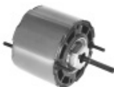
541 (Nutone) 636 (Broan)