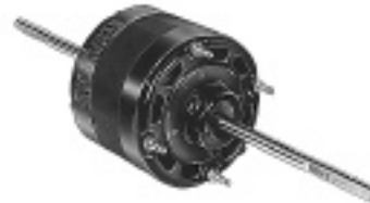
52, 53, 54, 55, 322, 363, 364