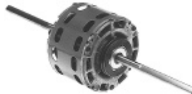
379, 389, 393, 591, 640 745, 9615