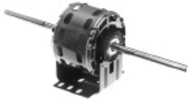
89, 93, 320, 9407