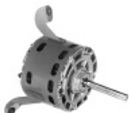
9420, 9421, 9422

Features: Two hole lugs replace both 9" and 10" bolt circle • One hole lugs replace 9" bolt circle