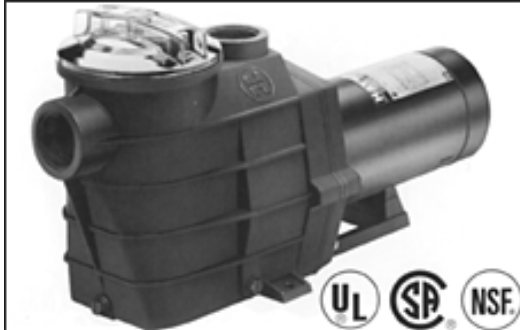
SP3015X20AZ 2 HP Super II pump.

Designed for even the most demanding installations, Super II simply out-performs all others. Efficient, full-flow hydraulics produce more flow at equivalent horsepower, resulting in lower operating costs. Super II, when you want the very best.