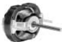
Fig. A D200, D201