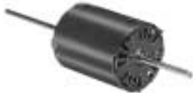
Fig. D D326