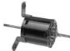
Fig. H D1111