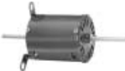
Fig. F D1112