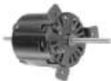
Fig. G D1113