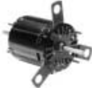
Fig. B D325