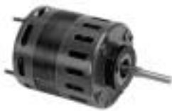
Fig. A D480, D481, D482, D483, D484, D485