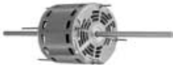
Fig. E D772