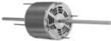
Fig. D D770, D771, D773, D774, D775, D776, D777