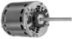
Fig. A D786, D789