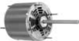
Fig. C D780, D782, D785