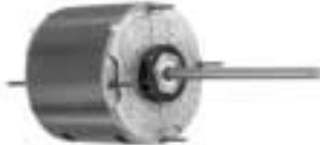
Fig. B D781, D783, D784, D787, D788