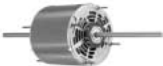
Fig. F D778