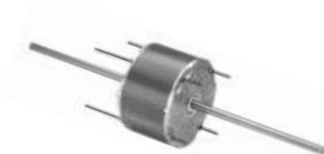
Fig. B D766