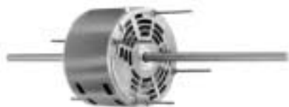
Fig. A D750, D751, D752, D754, D755, D756, D757, D758, D760, D761, D763, D769