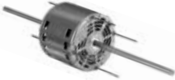
Fig. A D3771, D3772, D3758, D3760