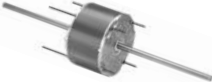
Fig. B D3775, D3774, D3752, D3755