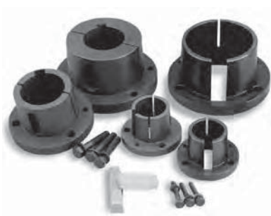
STL Taper bushings • See page 16